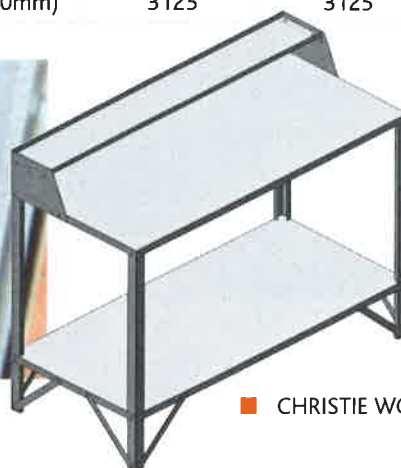
CHRISTIE WORK BENCH