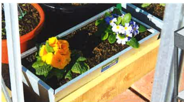
CHRISTIE PLANTER BOXES