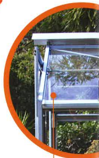
SUPERIOR GLASS PANELS